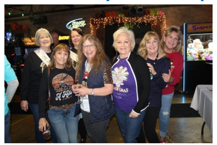
January Happy Hour Next Happy Hour is Thursday, February 16th, 2023 The Mineshaft

902 NE Interstate 410 Loop, San Antonio,