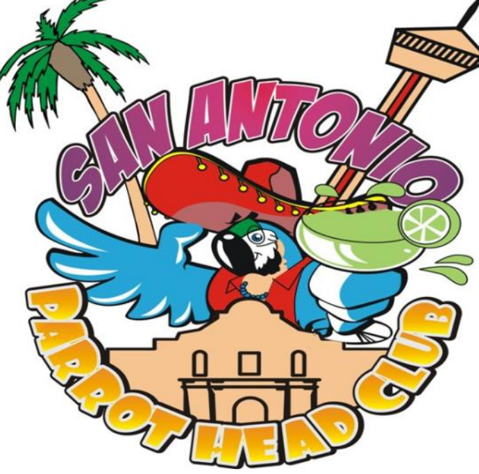
SAPHC - We Party with a Purpose!