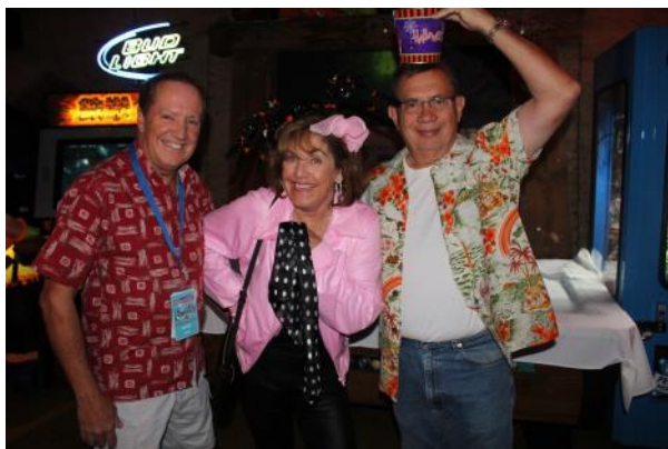
For once, there are no words.... If you have a caption for this one, email us at: 54sailaway@gmail.com