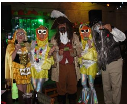
Everyone gets a prize!!!