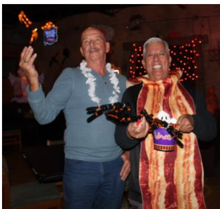
What is life without BACON!!!!