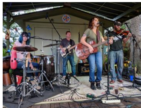
Drop Dead Dangerous June 19 Isla Bella