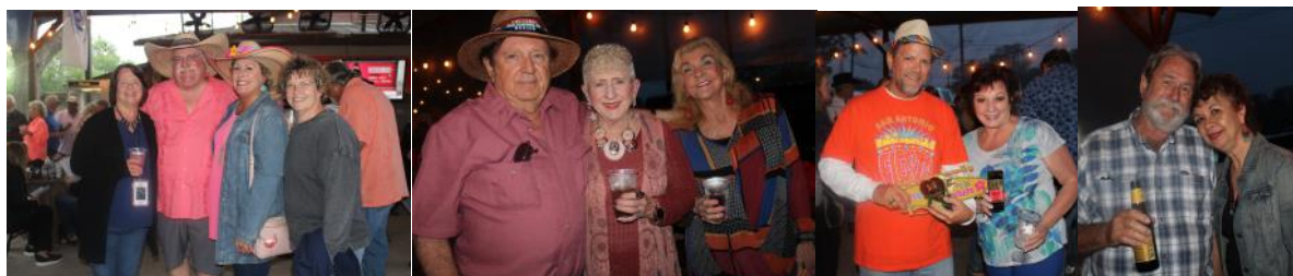
Big ole hats