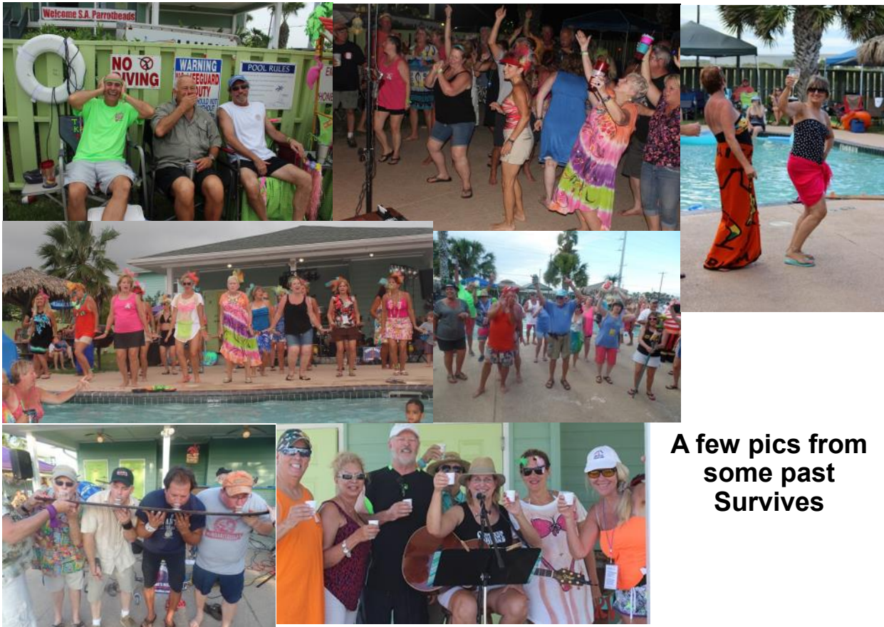
A few pics from some past Survives