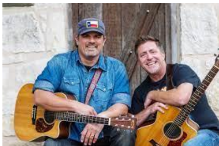
The Detentions Isla Bella July 3