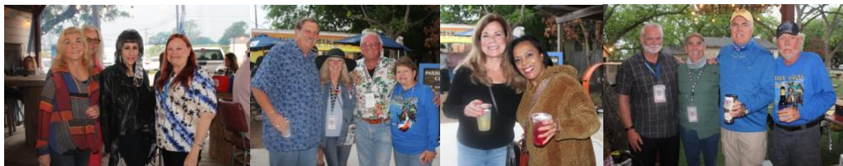
There's trouble brewing there.