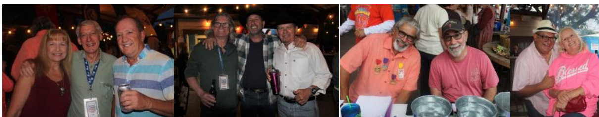
Someone forgot who he was so he had to wear his name tag.