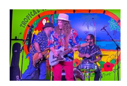
Life is Good!!!