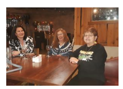
Thanks for being a part of SAPHC