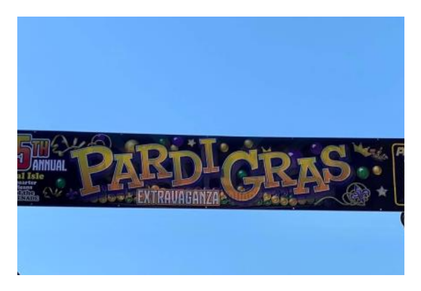
Viva Pardi Gras!