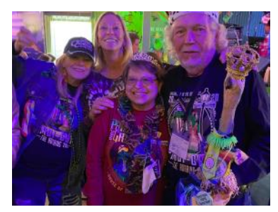
Light shines on Happy People