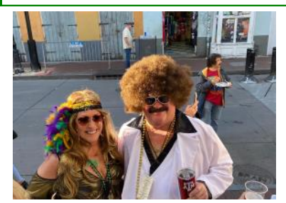
This Month's Happy Couple!