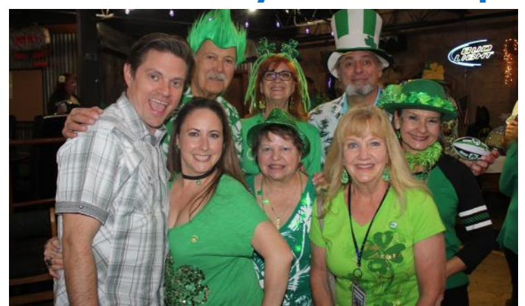
March Happy Hour Next Happy Hour is Thursday, April 21, 2022 Bracken Store Ice House 18415 Bracken Dr, San Antonio, TX 78266